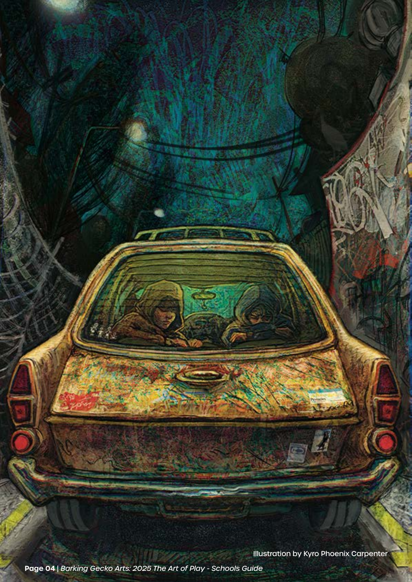
Illustration by Kyro Phoenix Carpenter